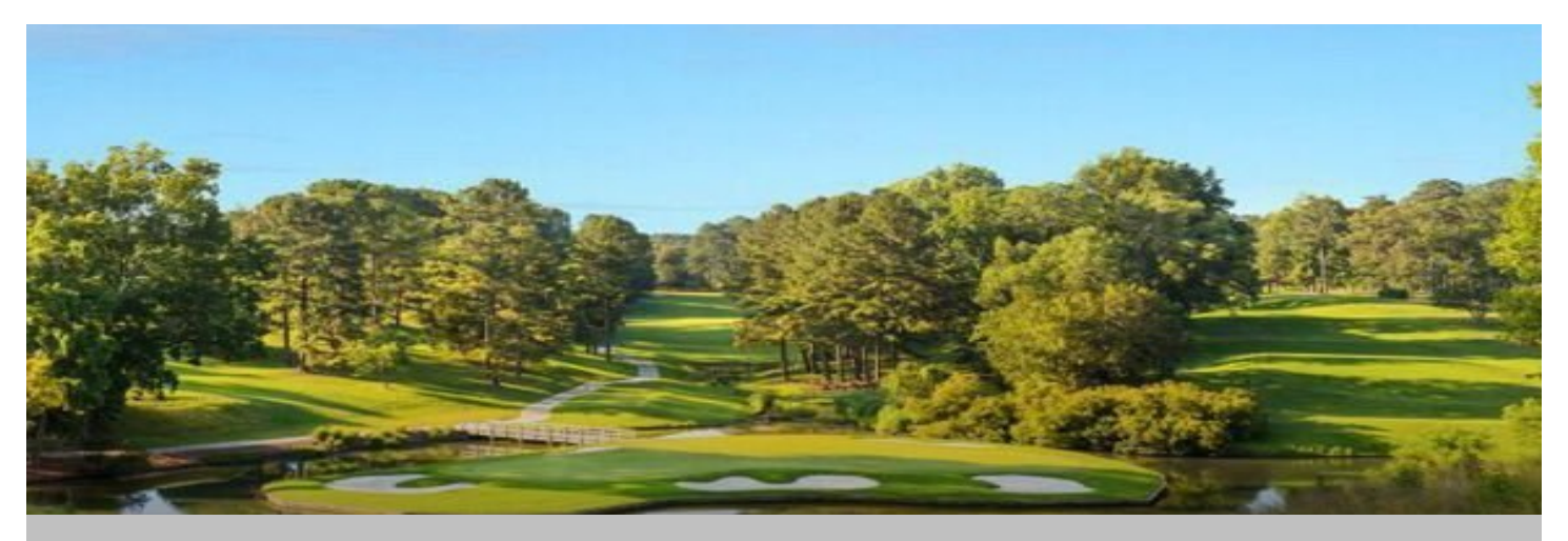
The Mandan Municipal Golf Course has been a recreational staple in Mandan since 1925. The established course features a players friendly layout that still allows golfers of all skill levels to test every club in their bag. Mandan Municipal Golf Course has long been a favorite of beginners, juniors, and seniors who prefer a less formidable challenge. A perfect place to enjoy a relaxing round of golf, Mandan Municipal is a throwback to the glory days of golf.