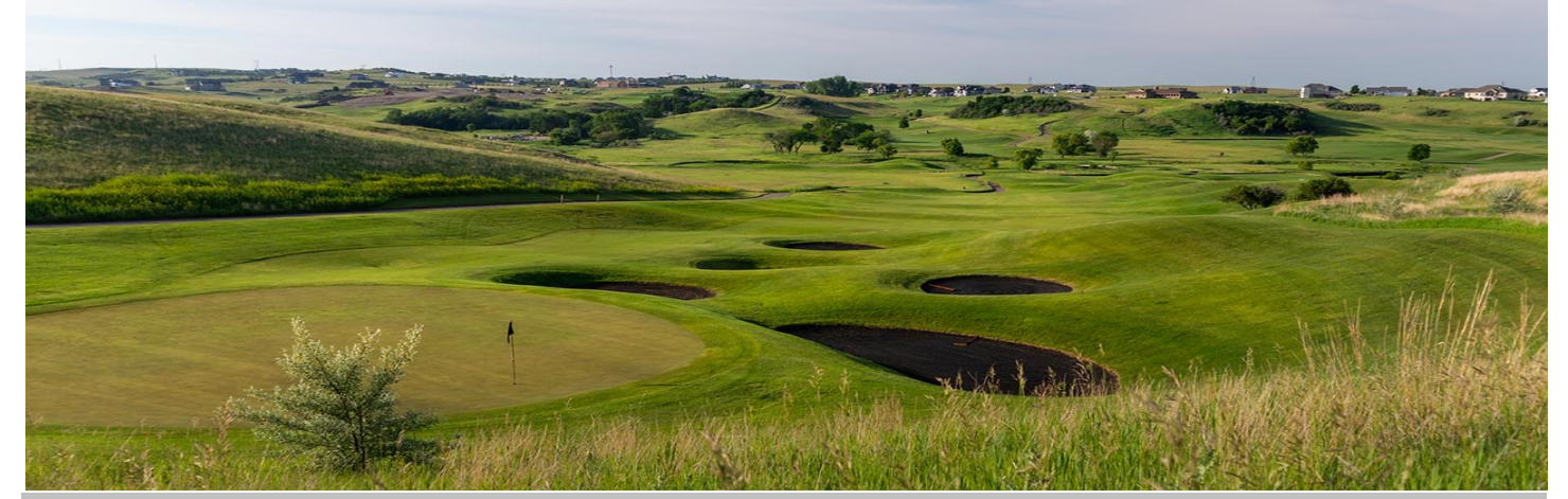
Hawktree Golf Club This 18 hole, Par 72 championship golf course offers 18 distinctive, unique holes, featuring natural elevation changes that are both unexpected and exciting. Natural hills and contours, brilliant colora tion, plentiful wildlife and native grasses add mightily to the eco experience. This golf course soars and will fly right onto your list of favorite courses.