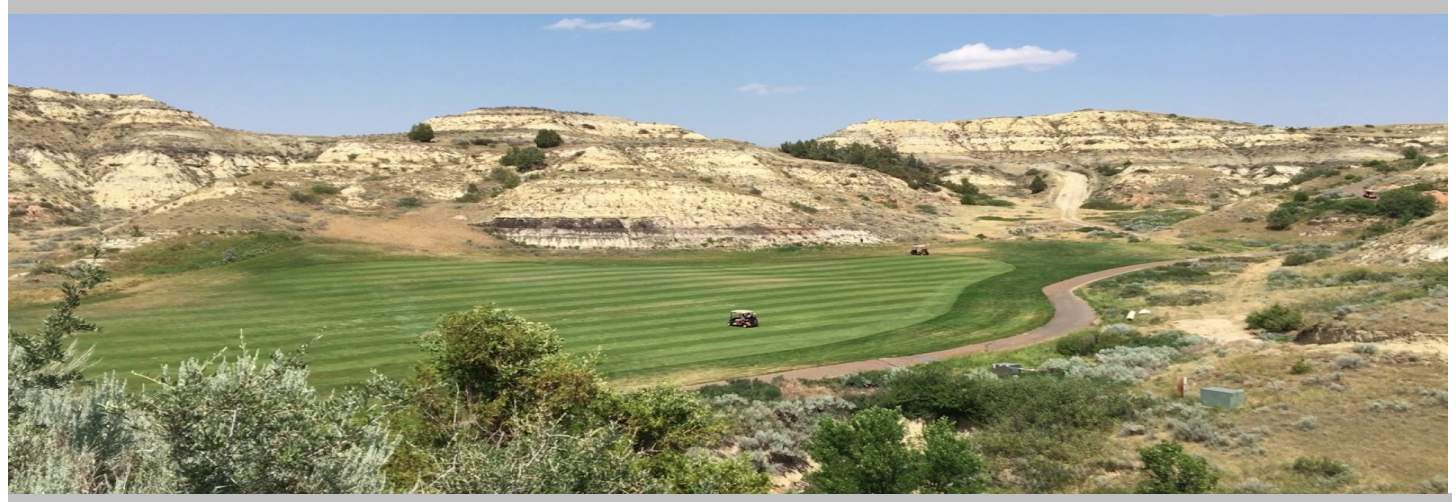
Bully Pulpit Golf Course. Some courses impose themselves on the landscape, but at Bully Pulpit Golf Course you'll find yourself climbing through meadows and woodlands and meandering along the Little Missouri River, fully immersed in the beauty of the landscape all around you. As you climb out of the shadow of the bluff on thirteen green, our signature holes await. The back nine Badlands holes will take you through a rugged fairway gorge. From butte-top tee boxes to a green among a sea of Badlands, this is one golfing adventure you're not soon to forget